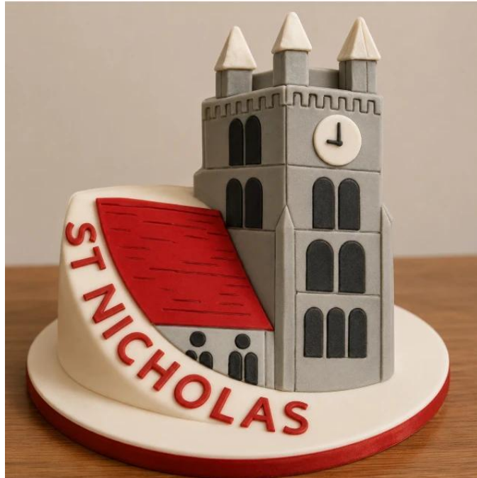
🧁 ROWAN CLASS BAKE SALE! 🧁

Next week, Rowan class is on a mission to raise vital funds for the Motor Neurone Disease Association (MND). ❤️ We need your help to make it a success! We are asking our wonderful families to donate cakes for our big sale at the end of the school day on Friday 22nd May. Whether you bake them or buy them, every single donation will make a huge difference. Thank you so much for your support! Let's bake a difference together! 🍰 ✨