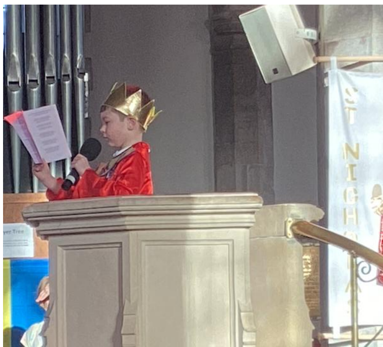
The children performed the tableau during our Christingle service, speaking and performing in front of family and friends. All singing the first verse of Away in a Manger.