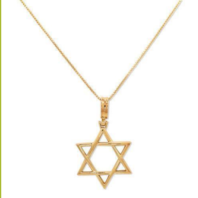
Star of David