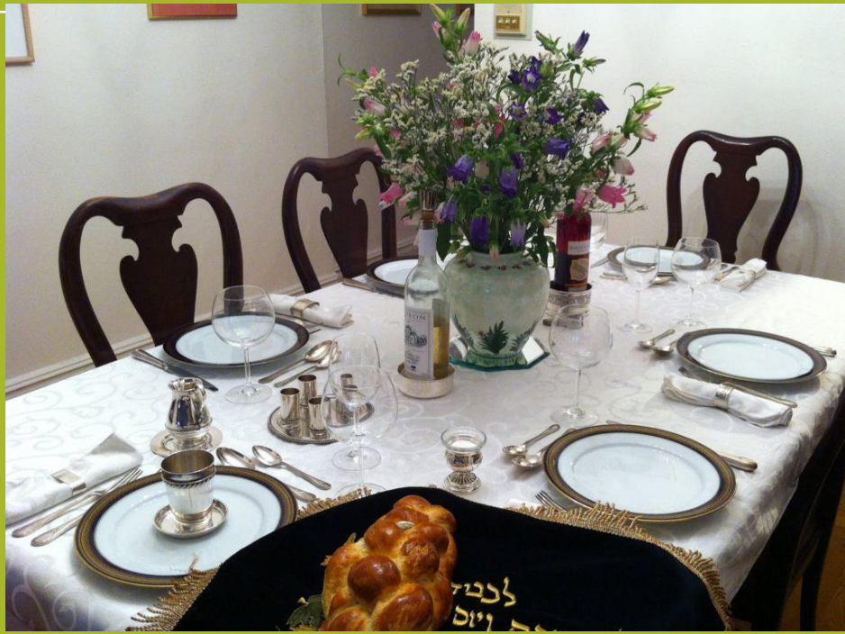
Shabbat dining table