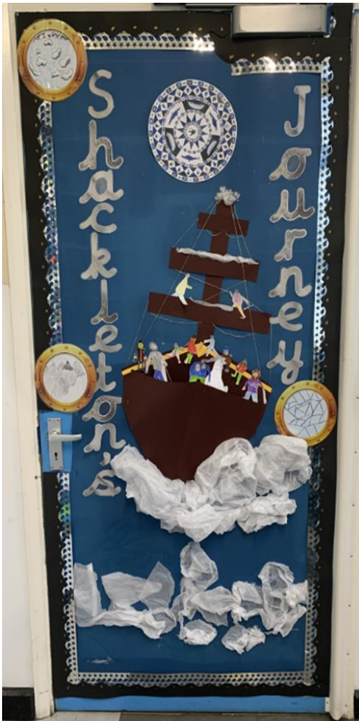
Year 5 – Willow