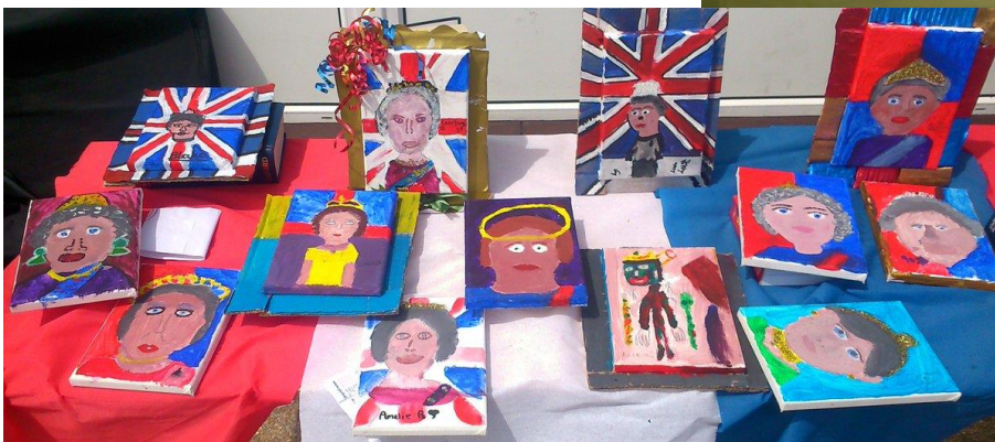
...and portraits of Her Majesty.