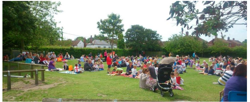
The children had all their craft work on display