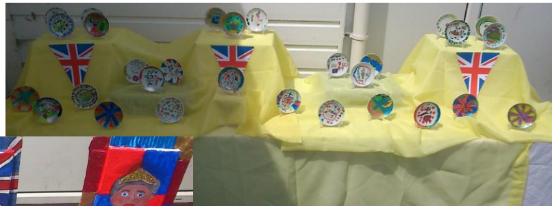
With hats fit for a Queen!