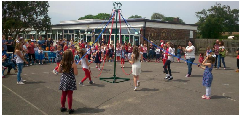
There was Maypole dancing for all to see